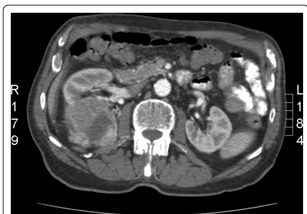
Figure 3 Large clear cell renal cell carcinoma prior to nephron-sparing surgery in a patient with chronic renal failure.

standard of care for localized resectable RCC of any size [1,22,23], although this is not yet reflected in routine clinical practice. A recently published population-based case-control study conducted by Miller et al. [6] in metropolitan Detroit and Chicago showed that until 2007 almost 80% of patients with localized RCC were treated by radical and only 20% by partial nephrectomy. This is alarming, since several trials have clearly demonstrated that total removal of the kidney was associated with a higher risk of postoperative renal failure [2], cardiovascular disease [3], diabetes [4] and even early death [3,5].