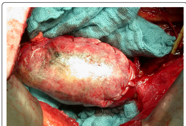
Figure 4 Hydrated porcine small intestinal submucosa (Surgisis®) trimmed and tacked in place over the large renal parenchymal defect (cf. Figure 3), fixed with two running sutures.

While it is generally agreed that a nephron-sparing approach should be adopted for surgical treatment of localized RCC, the optimal technique (open, laparoscopic, or robot-assisted) is still under debate and probably of secondary importance [10,24,25].